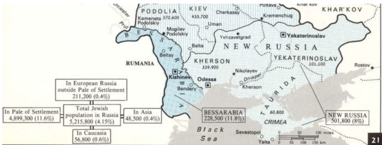
Map source: Atlas of Modern Jewish History by Evyatar Friesel